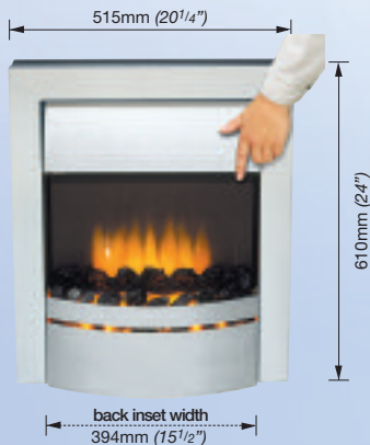
MODEL 103CHR WITH COAL

Inset: Suits standard openings of 406mm or 457mm (16" or 18") wide x 559mm (22") high. Freestanding: No fireplace opening is required. 2kW Fan Heater and switches concealed under canopy. All Artus models have fixed fire front as illustrated.