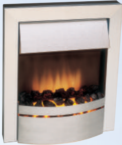
■ Artus BRUSHED CHROME MODEL 103CHR SEMI INSET WITH COAL