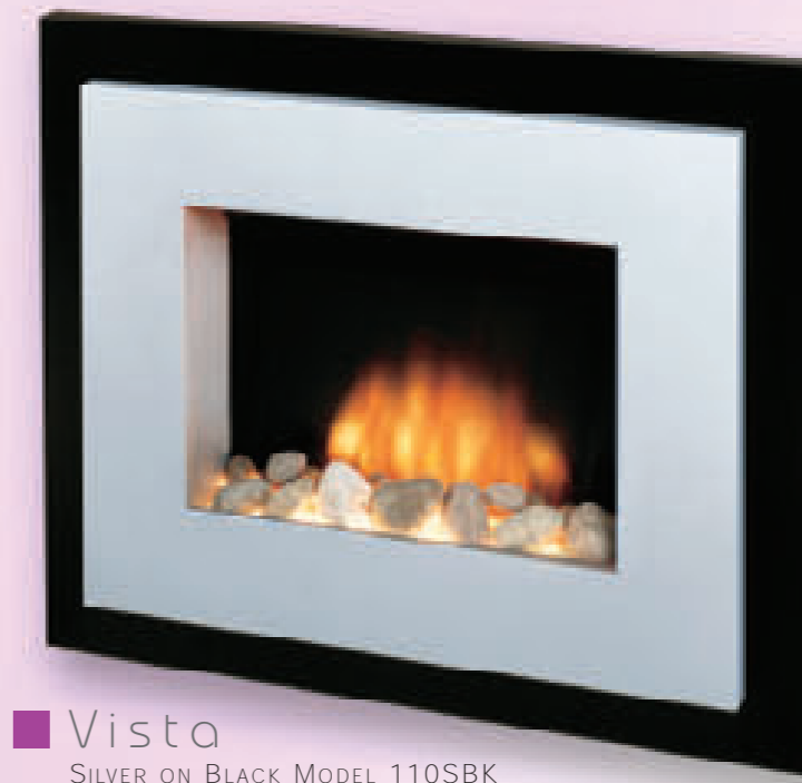
Vista SILVER ON BLACK MODEL 110SBK INSET WITH PEBBLES