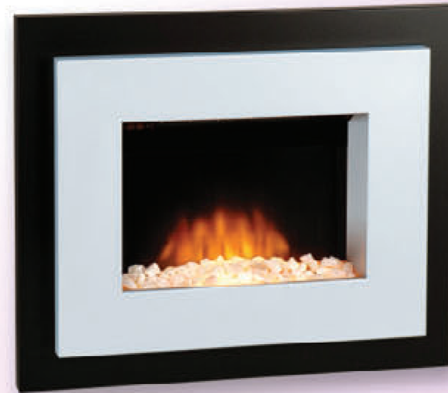
Vista SILVER ON BLACK MODEL 110SBK INSET WITH ICE