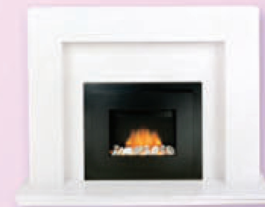
Vista BLACK MODEL 110BLK SHOWN INSET WITH A CONVENTIONAL SURROUND AND HEARTH. ALL VISTA FIRES CAN BE INSET, SEMI INSET OR FREESTANDING, WITH OR WITHOUT A SURROUND