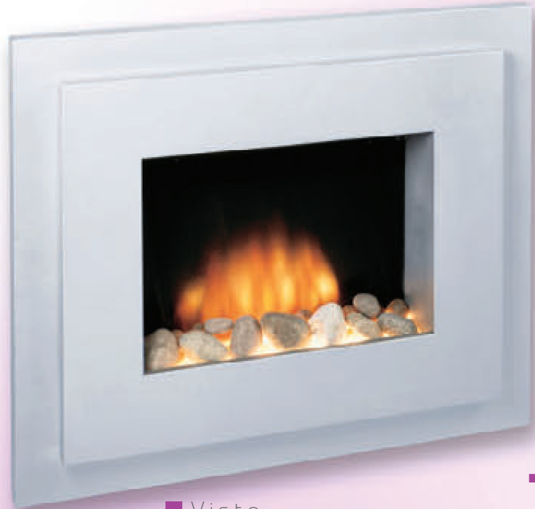
Vista SILVER MODEL 110SIL INSET WITH PEBBLES

ALL VISTA FIRES CAN BE WALL MOUNTED, WITH OR WITHOUT A SURROUND.