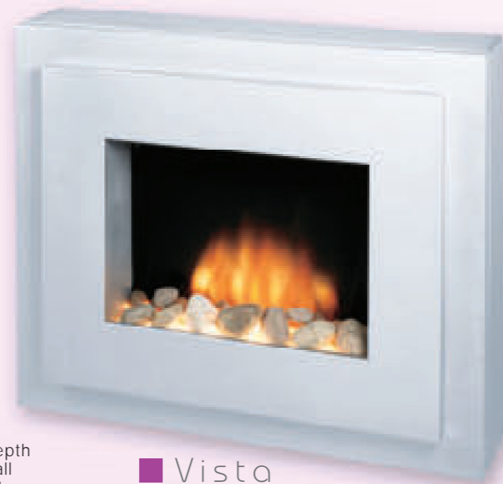
Vista SILVER MODEL 110SIL FREESTANDING WITH PEBBLES